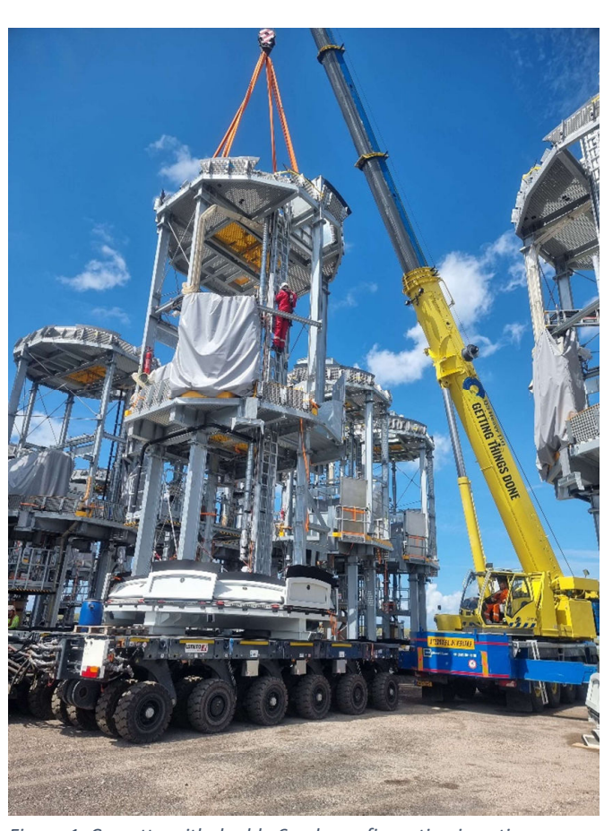
Figure 1, Cometto with double 6-axle configuration in action

Q3 offers multiple other pieces of machinery & equipment as mobile cranes, trucks, trailers, load spreading, supports & tools. This makes Q3 a partner for the total work package.