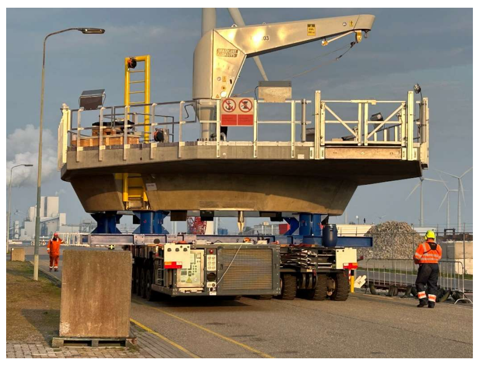
Figure 2, SPMT-transport of concrete working platform