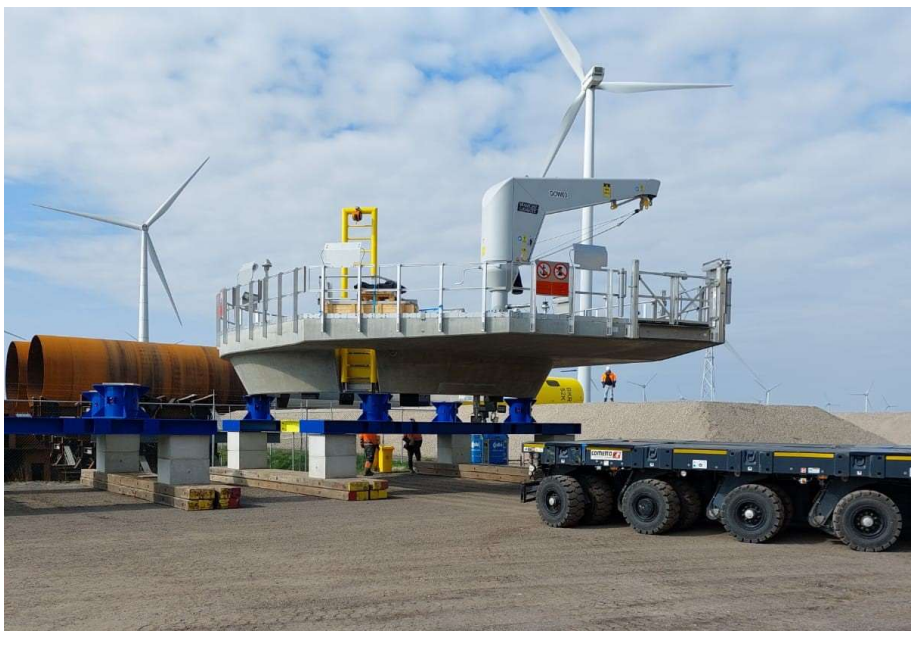
Figure 1, Storage on height of concrete working platform for SPMT-transport