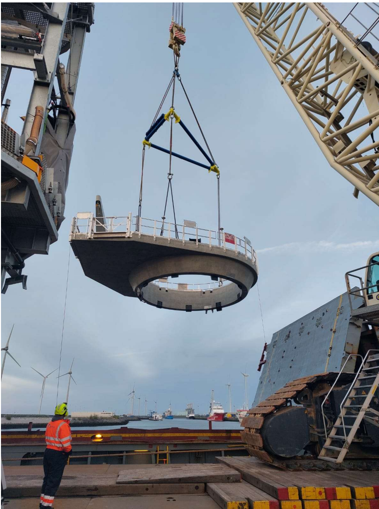
Figure 1, CWP lifted using the CWP loadspreader and CC6800 crane

In order to make sure the load is lifted level, weight can be placed on one side of the spreader to even slight imperfections. This will result in a optimal operation.