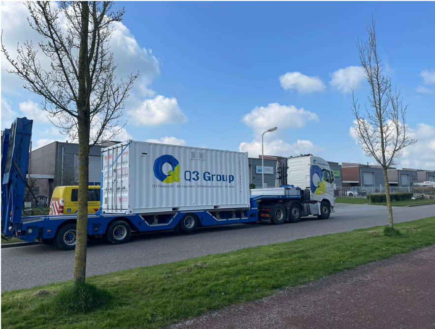
Figure 1, low loader trailer with Q3 Group container