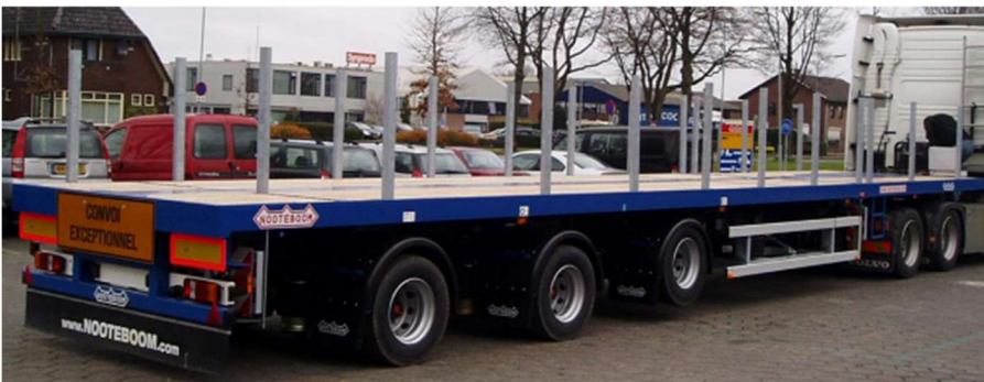
Figure 2, flatbed trailer

The Q3 flatbed is a NOOTEBOOM OVB-48-03V. A flatbed trailer is a typical open deck unit without a roof or side panels. It is mainly used for transporting heavy, oversized, wide and fragile items such as machinery, building materials and equipment. The flatbed makes loading and unloading cargo much easier. The trailer weighs 12t and together with our Volvo FH 500 it is able to transport 28t.