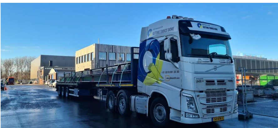
Figure 3, flatbed trailer with Q3 Volvo FH 500

With our wide range and flexibility of equipment and knowledge, Q3 is your partner for getting things done.